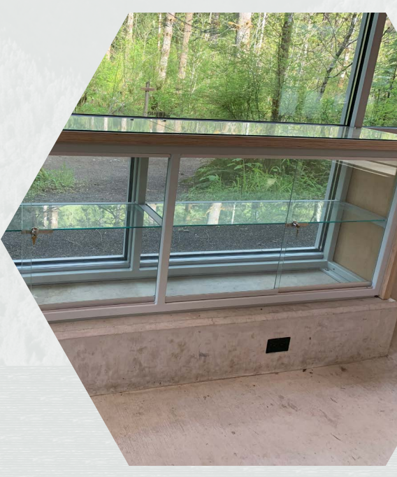
TFC Pavilion Cases