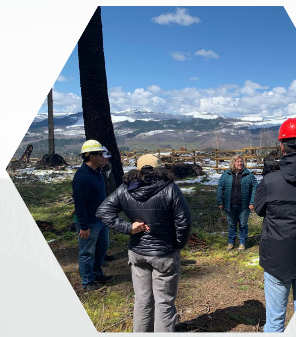
Santiam State Forest Horse Camp

As part of our operations, the Trust Board activated internal committees for Development (fundraising) and Marketing and Communications which can include interested non-board members. If you are interested in providing input to the Trust on our strategic plan or the committee activities, please click here for a brief survey.