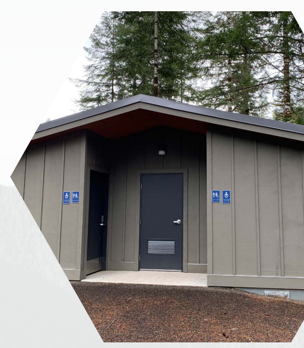
New Restroom Facilities

The Trust is also supporting a new effort by the ODF recreation team to better understand visitor use and economic impact of visitation on state forests. A team led by a Trust volunteer involves Oregon State College of Forestry and University of Washington School of Environmental and Forest Sciences in implementing a year-long pilot program at the Black Rock Mountain Bike Area in Polk County. The research project deploys advanced and scalable visitor use monitoring tools that can then be applied across state forests to inform future planning and funding.